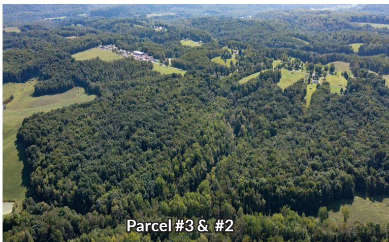
Parcel #3 & #2